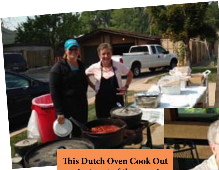
This Dutch Oven Cook Out was just part of the amazing time our residents had during our annual Camping Week!