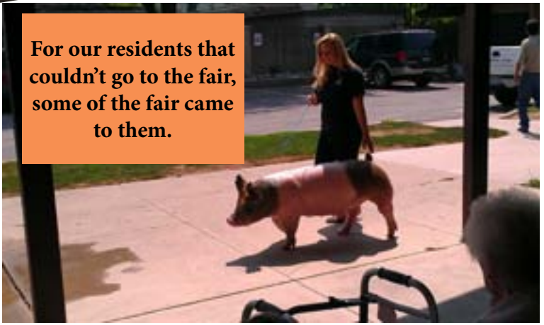
For our residents that couldn't go to the fair, some of the fair came to them.