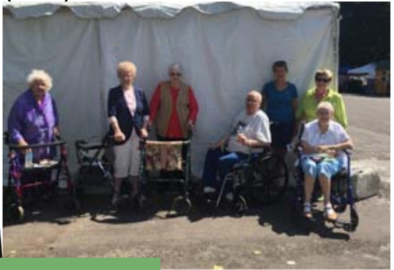
County Fair! Our Terrace Grove residents not only went to the county fair, but they won blue ribbons with some of their entries!