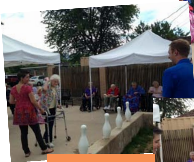
Residents has a great time at our Water Balloon Target Throw!